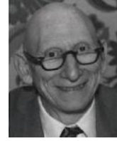
Alan Perlis First Department Head

Led by a group of visionary enthusiasts, including Allen Newell, Herbert Simon, and Alan Perlis, the Department of Computer Science was formed in July 1965, with Alan Perlis as its head. As one of the first such departments in the nation, its creation was what now seems an inevitable step. From the very beginning, Computer Science at Carnegie Mellon was interdisciplinary and, in fact, drew its early strength from this meshing of students and faculty from the component disciplines. It was clear that an expansive approach to the field, fueled with solid science and a focus on the training of a new generation of scientists, would best serve the purpose of our campus and the industrial/academic community at large. This was a budding field, and Carnegie Mellon would be serving a critical role in populating the discipline with “trained professionals” who would be able to expand the parameters of what a computer could do and be used for.